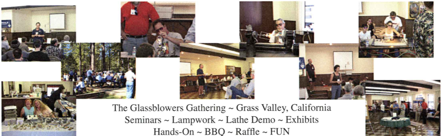
The Glassblowers Gathering ~ Grass Valley, California Seminars ~ Lampwork ~ Lathe Demo ~ Exhibits Hands-On ~ BBQ ~ Raffle ~ FUN

4. The Fall Meeting will possibly be the last one put on under the ASGS-PNW banner. The burdon has continued to fall on the shoulders of a select few who are getting burned out. The cost in time & materials to put this event on each year by two of the supporting ASGS member companies has become a financial burden. The net profits raised have gone into the section account. We have reserved a building at Condon Park for October 1st for the Fall meeting in Grass Valley. The section members will have to decide how they want to handle future gatherings AND who will be responsible for putting them on. The program will follow the same format as before with demonstrations, exhibitors, BBQ lunch, raffle and section meeting. The program will run from 10 am to 3 pm.